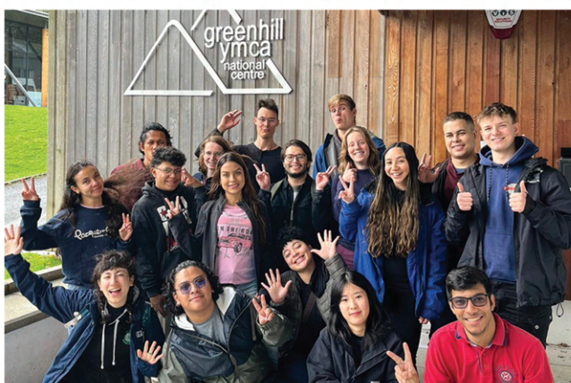
Greenhill grows with their latest intake of international volunteers from around the world September 2023