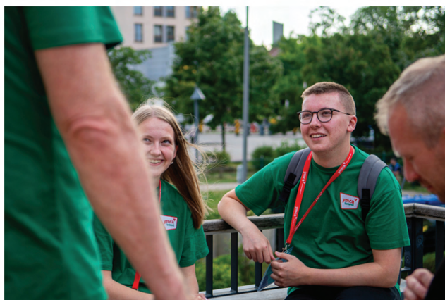
Young people, staff and volunteers join the YMCA Europe 50th celebrations in Berlin June 22