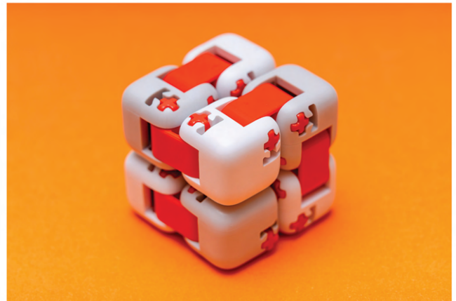
Staff take part in Neurodiversity Training, challenging our perspectives & strengthening our skill base February 23