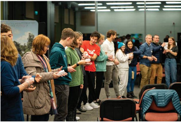
Launching our new Strategic Plan at our Annual Gathering + AGM in Greenhill November 22