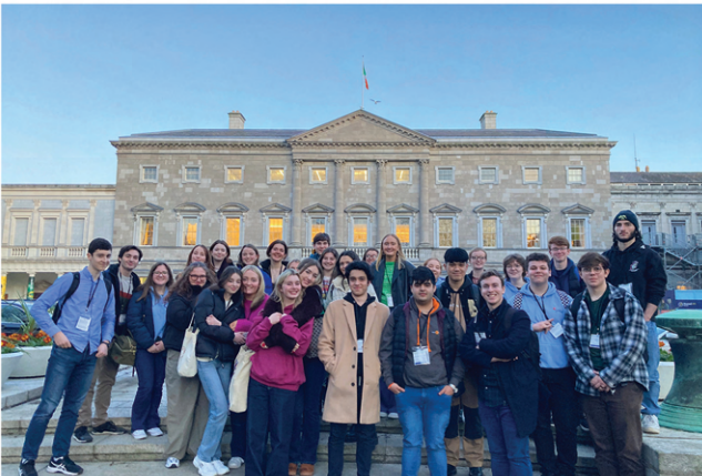
Belfast YMCA celebrate 25 years of their Youth In Government programme January 23