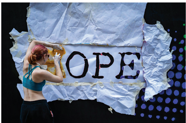
Bringing hope to Cork City with the Groundfloor Racial Justice Street Art project July 23